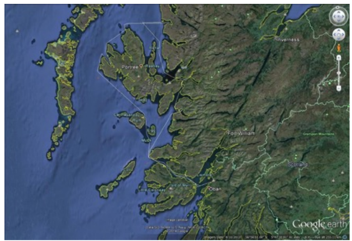
Pipedream's 2014 cruises

The cruise lasted from May until late August enjoying many anchorages and when possible moorings in the lochs, bays and harbours that festoon the coastline. The pub at Loch Nevis has no road access, so after going ashore for a pint and asking for a meal in the empty bar, Stewart was rather surprised to be asked if he had booked! yet 10 minutes later the bar was standing room only and not a clue as to where they had all come from !