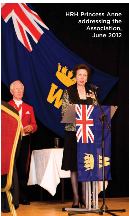
HRH Princess Anne addressing the Association, June 2012